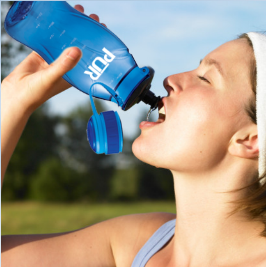
Extending the Pur brand outside of the home

This makes the use of bottled water unnecessary because the Pur-2-Go is just as easy to handle and quick to use. This grab and go usability of the Pur-2-Go makes it more convenient for everybody to commit to a greener lifestyle.