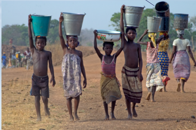
Works in any size or shape container

Pur Globe is just the product for developing markets with its amazing versatility and the same great filtration offered by our other Pur products. It is a spherical filter with the outer layer made of a membrane that filters out particles larger than 15-30 nm and a removable inner core of activated charcoal. The Pur Globe can be used in a multitude of vessels or containers to filter 0.5 gallons per minute. There are 2 built in color changing indicators to show when the water has been purified and to signal when the inner charcoal filter has to be changed. Pur Globe could be used by just dropping it into a vessel with water and shaking the vessel gently to facilitate waterflow through the globe. The product lasts up to 2 years with the charcoal filter changed every 3 months.